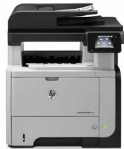
HP LaserJet Pro 500 MFP M521dn

Duty cycle (monthly): 12 Up to 75,000 pages